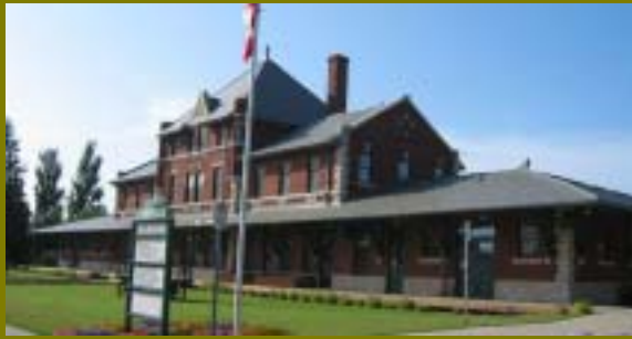
The City's renovated train station, built in 1914

With visions of wealth and freedom, the first frontier settlers of Scottish and English descent moved to the valley. Sawmills, flour mills and trading posts sprang up along the Vermillion River, Wilson River and the mouth of the Valley River. With the opening up of the heart of the region, population virtually poured in. Although the region was first settled by people from the British Isles, immigrants soon arrived from Germany, Central Europe and, most notably, the Ukraine. Dauphin quickly emerged as the main trading centre in central Western Manitoba.